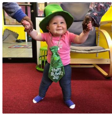
One of our Lucky Charms!