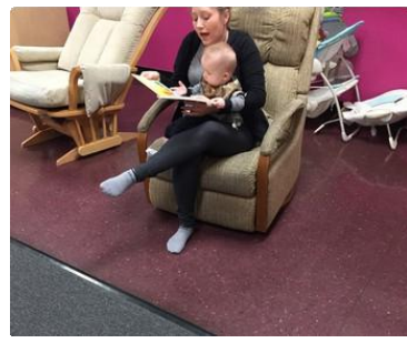
Everyone is a reader!