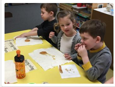
Around the World Feast